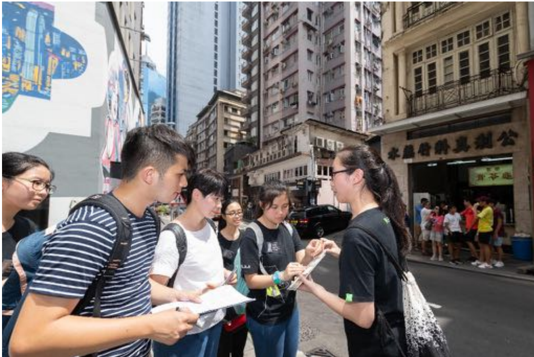
Champion team, Ying Wa Girls' School, designed a tour themed “Building for the People” to explore how architecture interacts with the community and reflects the daily needs of past residents.