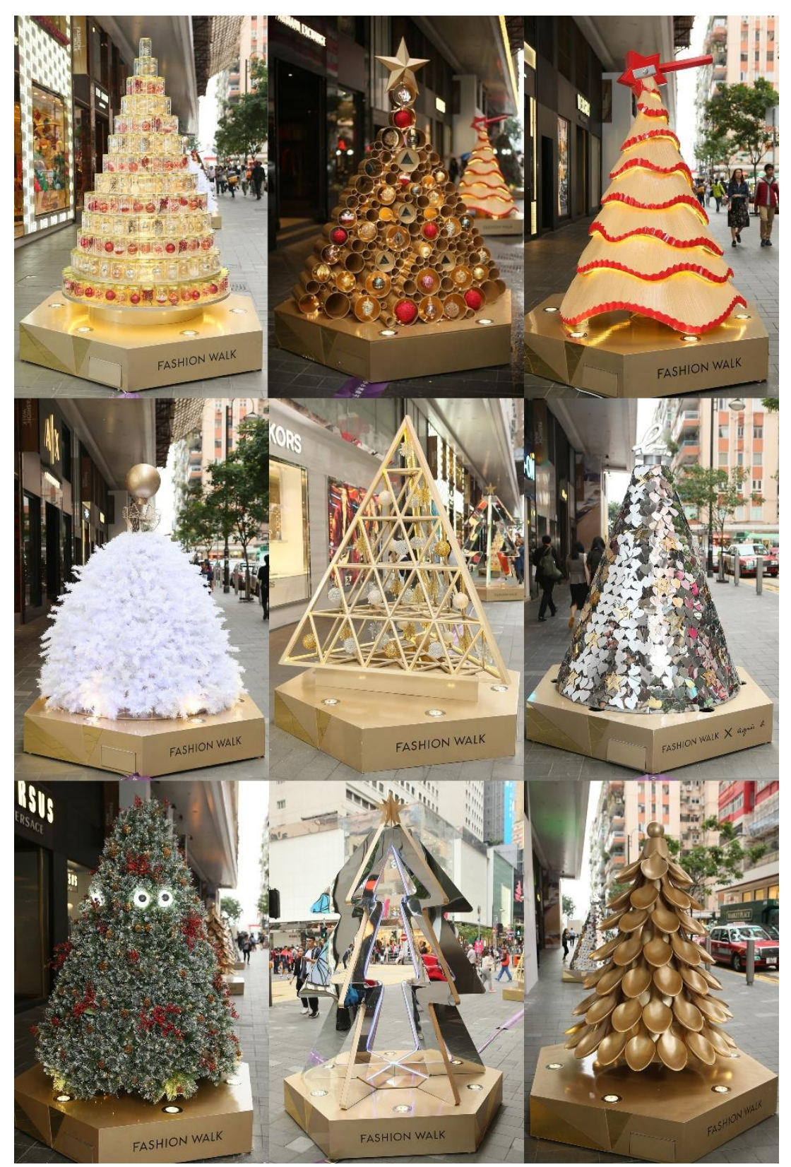
The Christmas spirit overflows Fashion Walk into Paterson Street with nine stylish Christmas trees made from stacked art patterns.