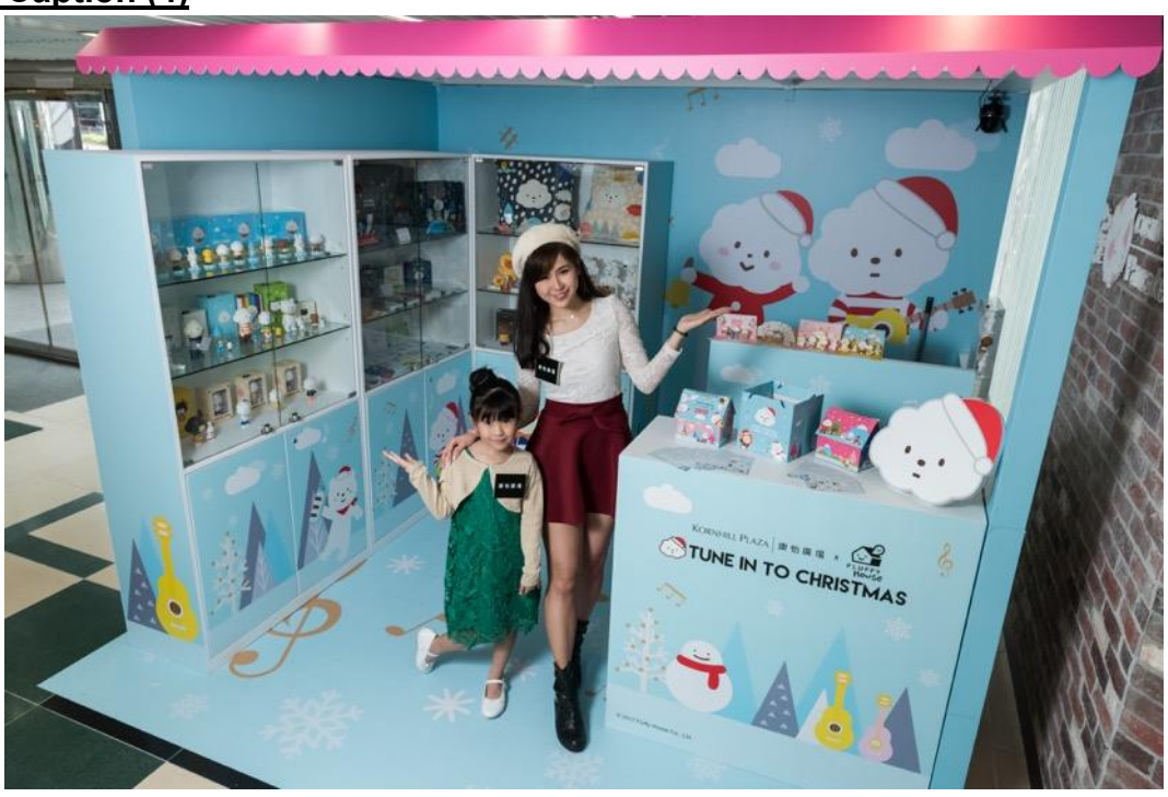
The very first FLUFFY HOUSE pop-up store is opening in Kornhill Plaza, housing a broad range of FLUFFY HOUSE products, of which some are debut collections in Hong Kong.