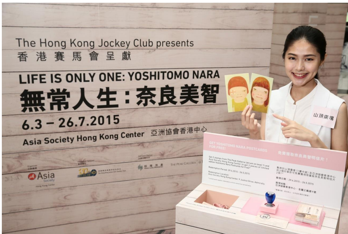
By collecting stamps at designated locations, visitors can redeem two pieces of limited edition of Yoshitomo Nara postcards.