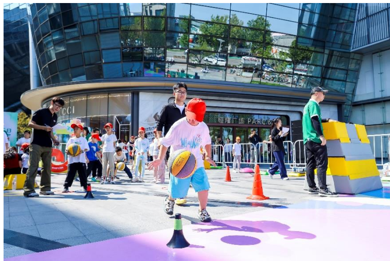
The volunteer team transformed the central street at Parc 66, Jinan, into different sports challenge zones, inviting underprivileged children to experience the joy of sports