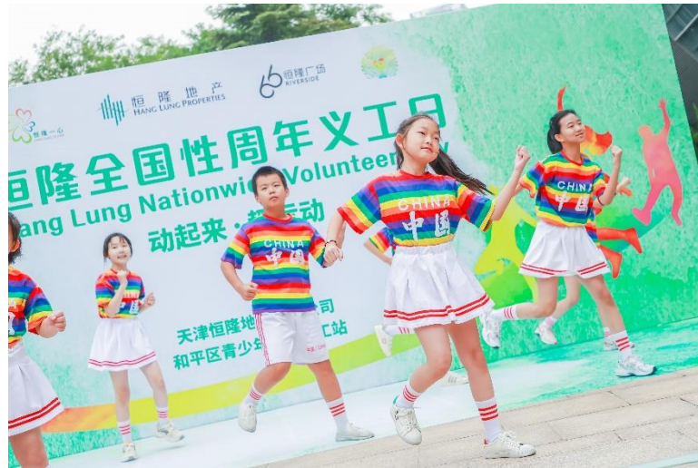
In Tianjin, the Hang Lung As One Volunteer Team organized a series of health-promoting sports classes and challenges for local elementary students. During the awards ceremony, a student performance showcased their achievements in sports