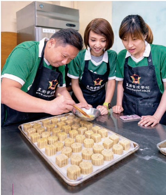
We organized various activities including workshops, yoga classes and Christmas Family Day to promote work-life balance and well being among our employees