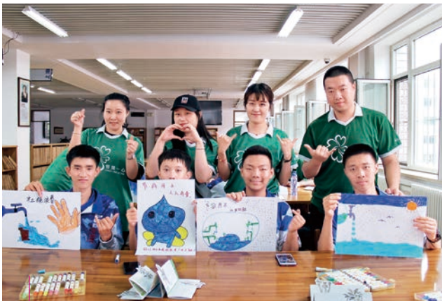
We organize meaningful activities in collaboration with our community partners along with our staff to support those in need

Growing with our community is a crucial element in our sustainability strategy, and the Hang Lung As One Volunteer Team is indispensable in realizing this goal. In 2019, our volunteer activities remained focused on three areas: youth development, elderly services, and environmental protection. This year, we organized 104 volunteer activities, devoting over 13,500 volunteer hours in Hong Kong and mainland China.