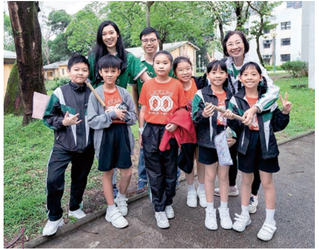
A wide range of volunteer activities with a focus on environmental protection was held in Hong Kong and mainland China to promote green living

In Hong Kong, working collaboratively with three organizations, namely Walk in Hong Kong, the Evangelical Lutheran Church in Hong Kong, and the Shatin District Community Centre for the Golden-Aged, we organized a guided tram tour for the elderly. We also arranged a guided tour and a blueprint craftsmanship workshop at the Blue House in Wan Chai for underprivileged children from Kwai Tsing as well as a bamboo upcycling camp for a group of primary school students to promote their understanding of upcycling.