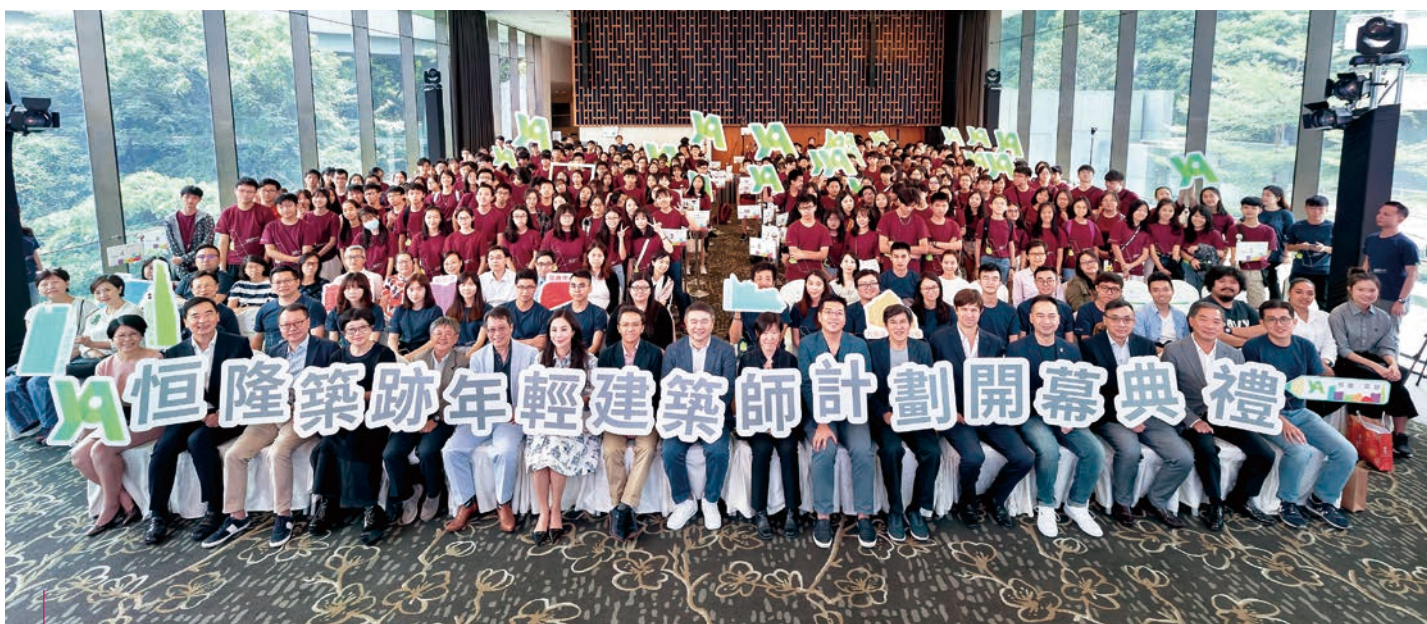
The Hang Lung Young Architects Program 2019-20 engaged 15 leaders from the construction industry and academia to take up roles as Program Advisors

Our sustainability performance and the transparency of our disclosure practices have received both local and international recognition. We have been listed as a constituent of the Hang Seng Corporate Sustainability Index in Hong Kong and the Hang Seng (Mainland and Hong Kong) Corporate Sustainability Index with an “AA” rating for the last decade. In the global arena, we have been selected as a member of the Dow Jones Sustainability Indices Asia Pacific Index for three consecutive years, and maintained a 3-Star performance rating and A-grade disclosure rating under the Global Real Estate Sustainability Benchmark (GRESB). These honors recognize companies with outstanding sustainability performance based on objective assessments of public disclosure, policies adopted, and performance in selected areas.