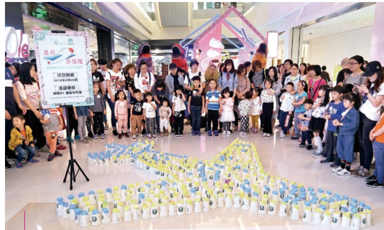
Our shopping malls and tenants co-organized activities to promote green and low carbon lifestyle to local citizens

To begin addressing the potentially damaging physical impacts of climate change on our business, we conducted a preliminary climate risk mapping exercise at the corporate level in 2019. We have also monitored our carbon emissions and appointed an independent consultant to verify our annual Scope 1 and Scope 2 greenhouse gas emissions.