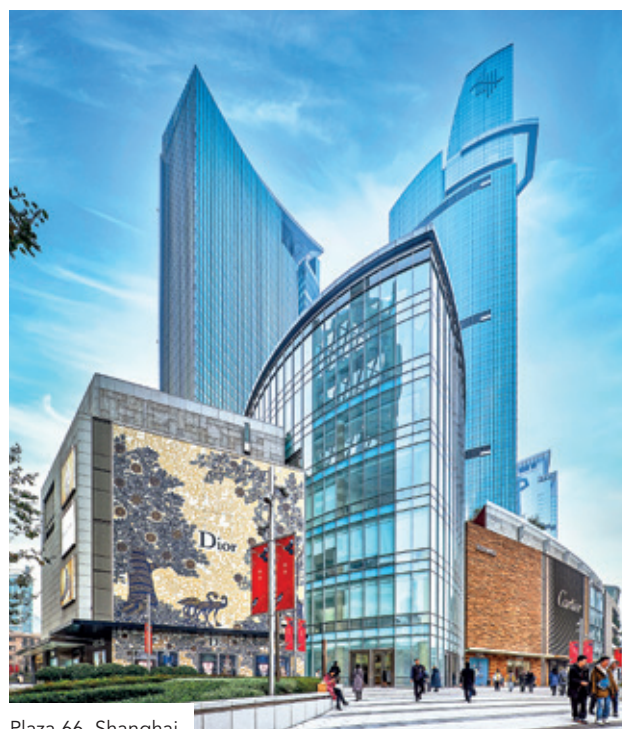
Plaza 66, Shanghai

One number can reveal a lot about our business. Our Plaza 66 in Shanghai alone achieved almost RMB11 billion, or about HK$12 billion in retail sales last year. That is almost twice of what all our Hong Kong shops took in combined. If we compare only the second half numbers, Plaza 66 then did 2.4 times. In a few years, sales at Grand Gateway 66 in Shanghai may also approach our Hong Kong total. This clearly demonstrated the personal consumption power of the Mainland. Consequently, as in the past two decades, our future efforts will focus up north. It does not mean that we will give up Hong Kong. As before, we will only pick opportunities on a very selective basis.