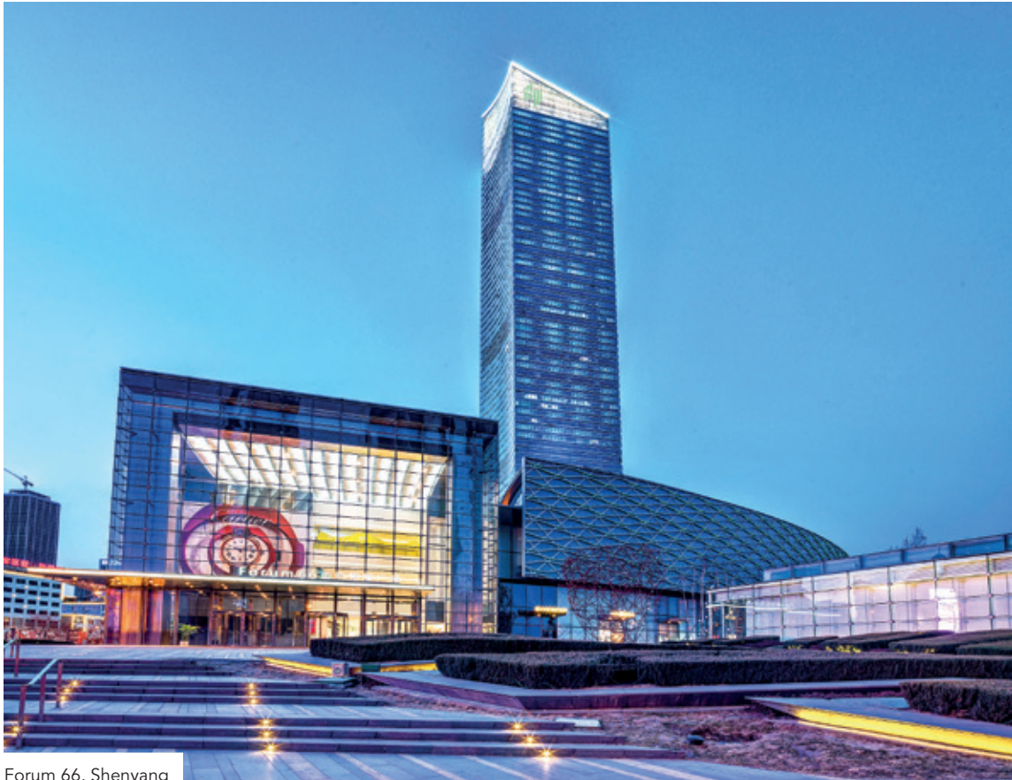
Forum 66, Shenyang

For this discussion, luxury centers included the two in Shanghai, Center 66 in Wuxi, and Forum 66 in Shenyang. In the other category were Palace 66 in Shenyang, Parc 66 in Jinan, Riverside 66 in Tianjin, and Olympia 66 in Dalian. The last mall was migrating to luxury status during this period, a process that will only reach completion by the end of this year, and as such, for the year in review, it was categorized as a sub-luxury facility. Spring City 66 in Kunming was inaugurated in August 2019 and was not included in the assessment.