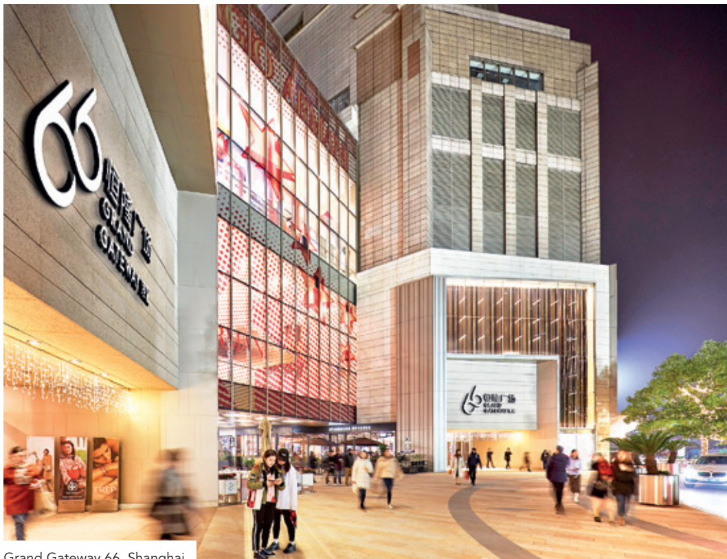
Grand Gateway 66, Shanghai

The Hong Kong economy is still struggling. I expect unemployment to go above 7% which is highly unusual for this town. Frankly, it may inch up further, if the pandemic is not quickly brought under control. Tourism will not recover so easily, and retail sales will still be sluggish. As such, I expect retail and office rents to remain weak as vacancy rises a little.