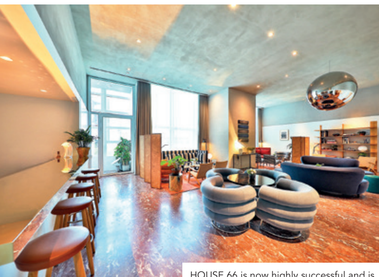
HOUSE 66 is now highly successful and is appreciated by tenants and shoppers alike

This set of results proves to us conclusively that our five-star malls outside Shanghai perform exactly like the two in Shanghai. The divide is not Shanghai versus non-Shanghai; the divide is luxury versus sub-luxury. Top-end facilities behave similarly wherever they happen to be. That said, what unit rents a property can command depends on the amount of retail sales it can generate. As such, to be the number one in Shanghai (Plaza 66) is far superior to being the number one say in Wuxi (Center 66). The market and our share therein matter.