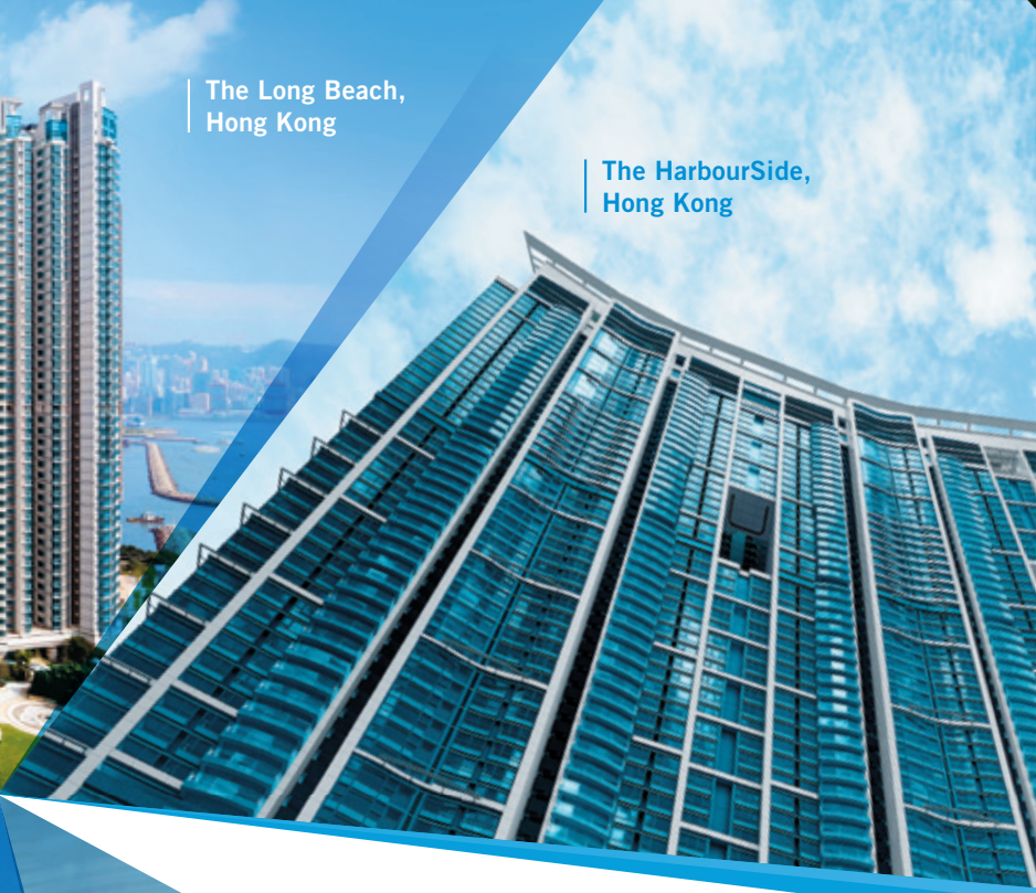
The HarbourSide, Hong Kong