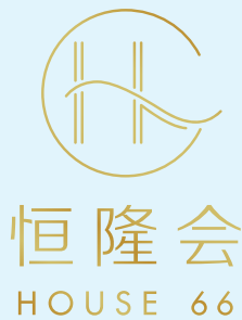
Launch of CRM Program – HOUSE 66