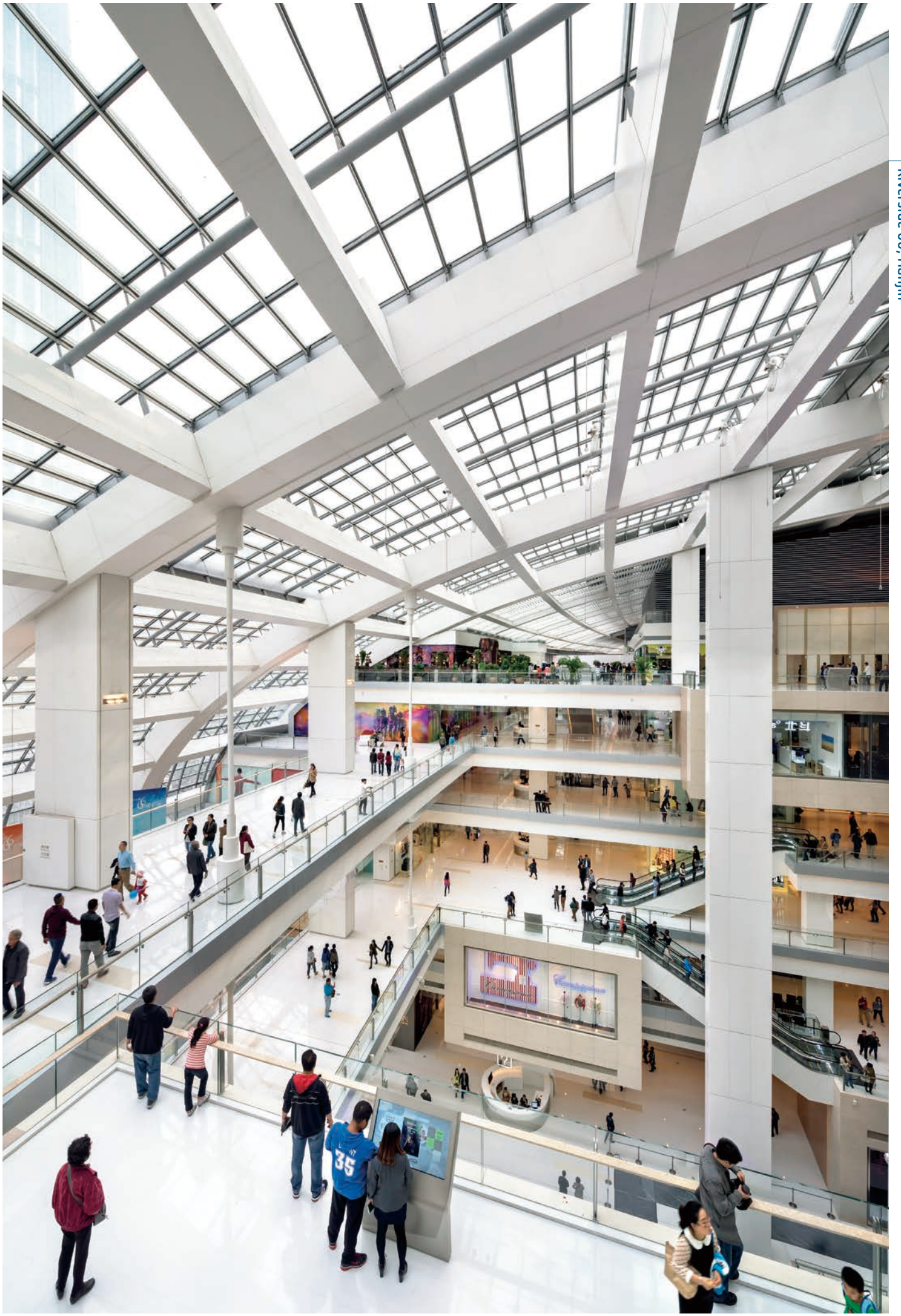
Riverside 66, Tianjin