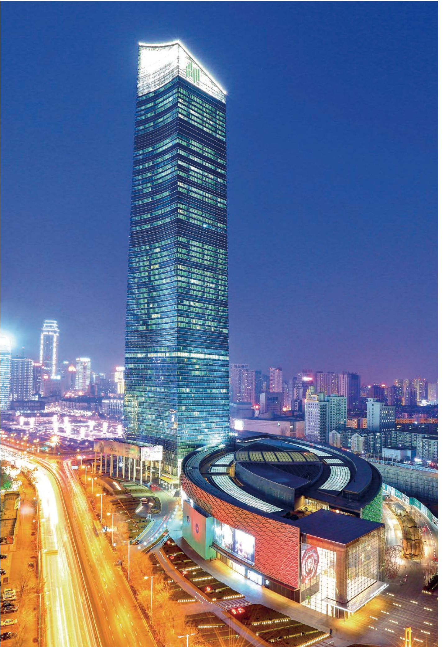
Forum 66, Shenyang