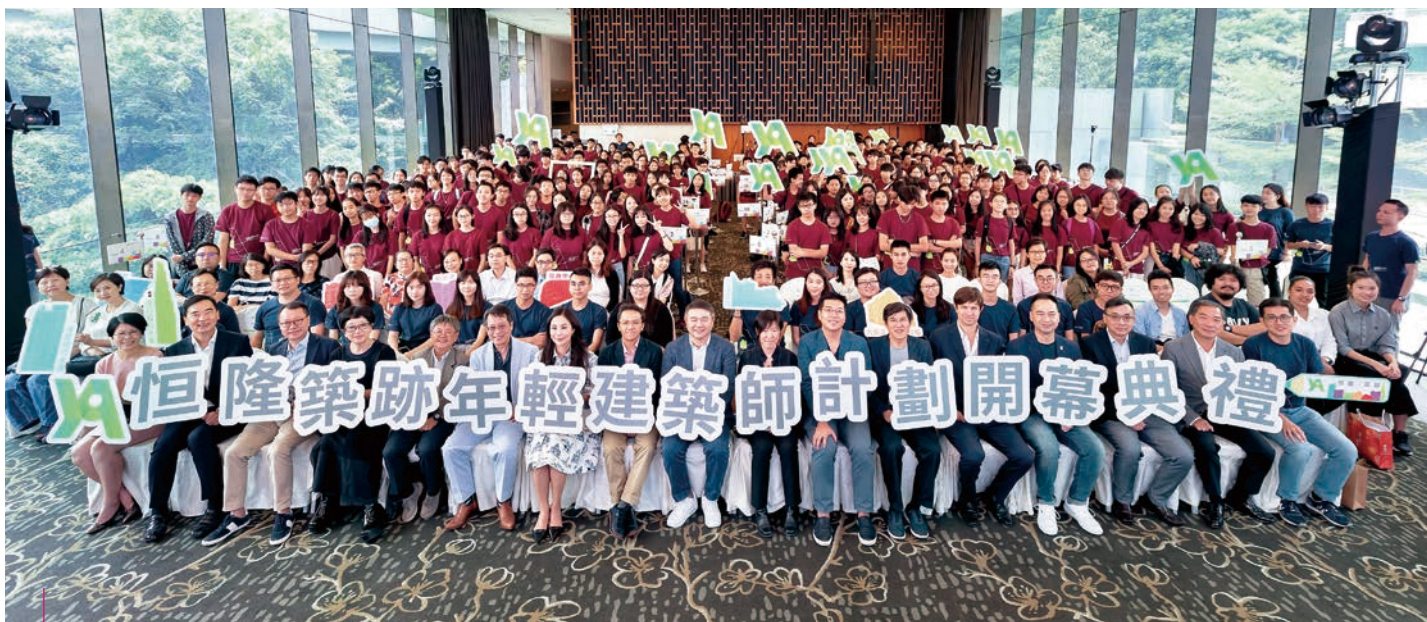
The Hang Lung Young Architects Program 2019-20 engaged 15 leaders from the construction industry and academia to take up roles as Program Advisors

Our sustainability performance and the transparency of our disclosure practices have received both local and international recognition. We have been listed as a constituent of the Hang Seng Corporate Sustainability Index in Hong Kong and the Hang Seng (Mainland and Hong Kong) Corporate Sustainability Index with an “AA” rating for the last decade. In the global arena, we have been selected as a member of the Dow Jones Sustainability Indices Asia Pacific Index for three consecutive years, and maintained a 3-Star performance rating and A-grade disclosure rating under the Global Real Estate Sustainability Benchmark (GRESB). These honors recognize companies with outstanding sustainability performance based on objective assessments of public disclosure, policies adopted, and performance in selected areas.