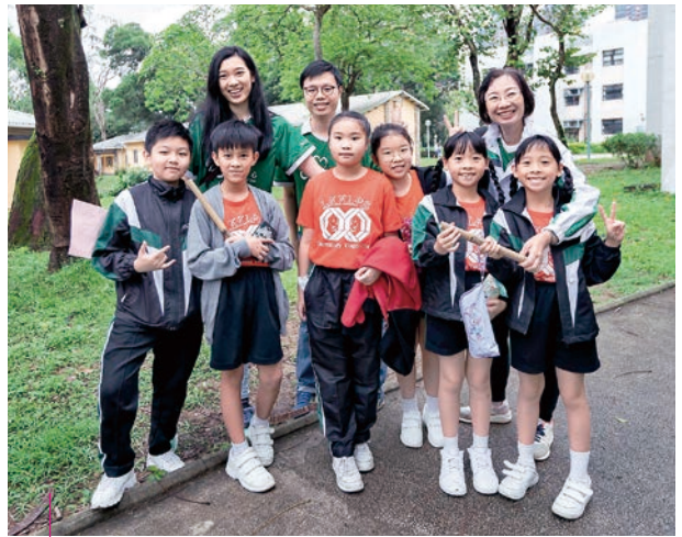
A wide range of volunteer activities with a focus on environmental protection was held in Hong Kong and mainland China to promote green living

In Hong Kong, working collaboratively with three organizations, namely Walk in Hong Kong, the Evangelical Lutheran Church in Hong Kong, and the Shatin District Community Centre for the Golden-Aged, we organized a guided tram tour for the elderly. We also arranged a guided tour and a blueprint craftsmanship workshop at the Blue House in Wan Chai for underprivileged children from Kwai Tsing as well as a bamboo upcycling camp for a group of primary school students to promote their understanding of upcycling.